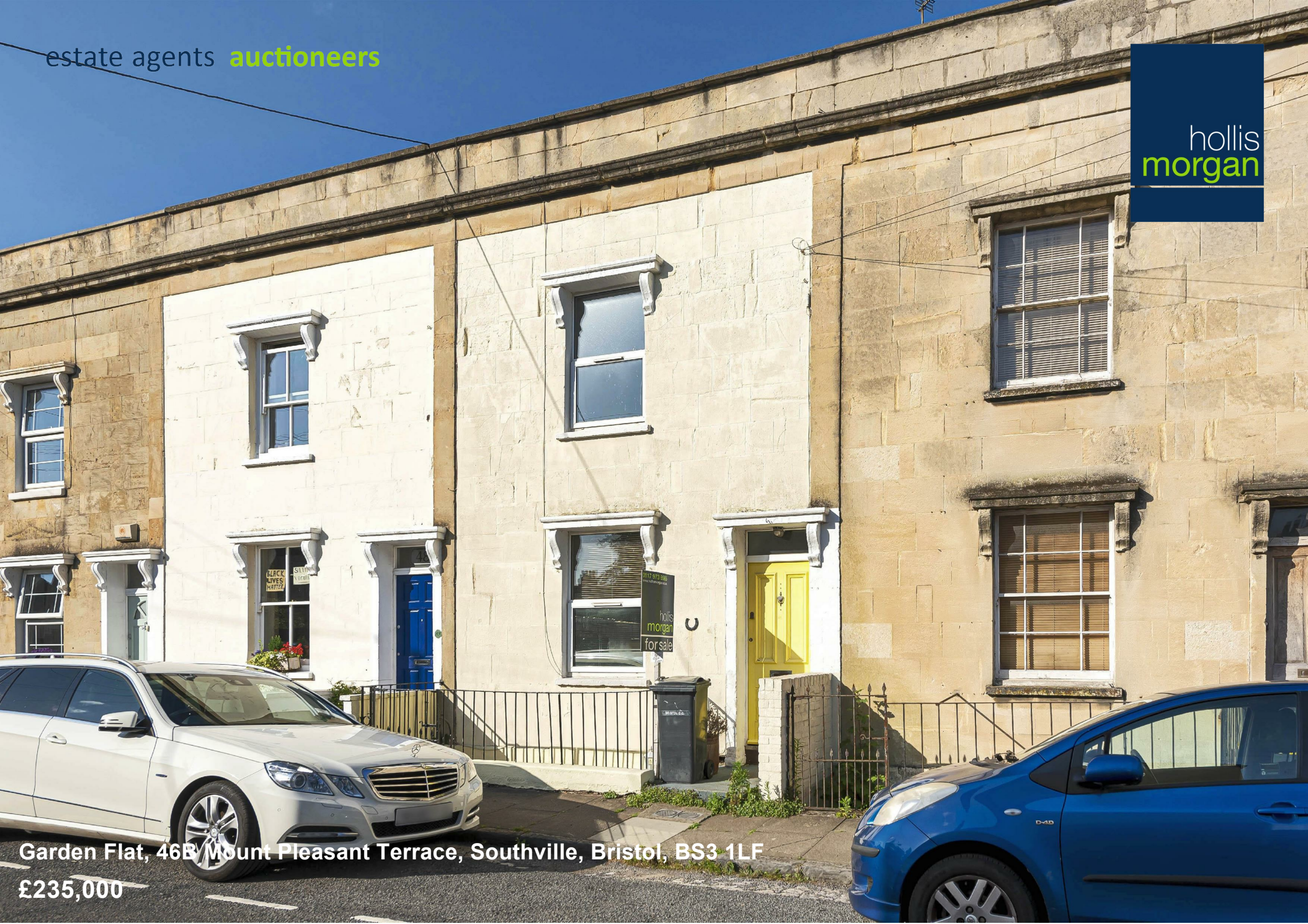
Garden Flat, 46B Mount Pleasant Terrace, Southville, Bristol, BS3 1LF